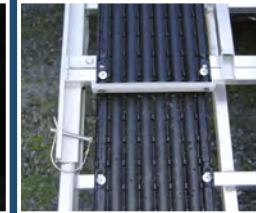
Ramp Locking Pin