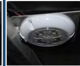
Under Deck Light