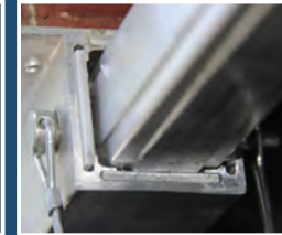
Sliding Side Extrusion